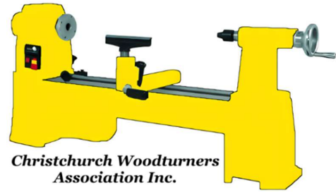
Christchurch Woodturners Association Inc.

The newsletter of Christchurch Woodturners Association Inc.