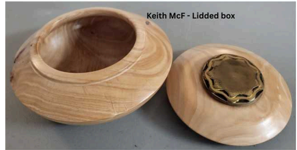
Keith McF - Lidded box