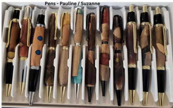
Pens - Pauline / Suzanne