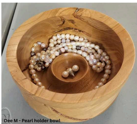
Dee M - Pearl holder bowl