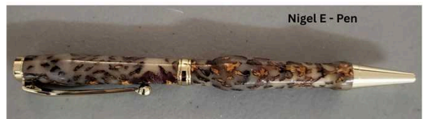
Nigel E - Pen