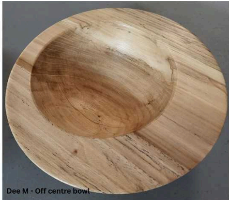
Dee M - Off centre bowl