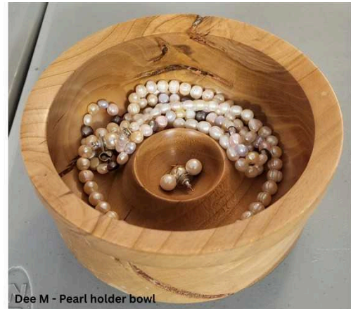
Dee M - Pearl holder bowl