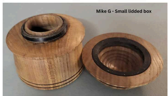
Mike G - Small lidded box