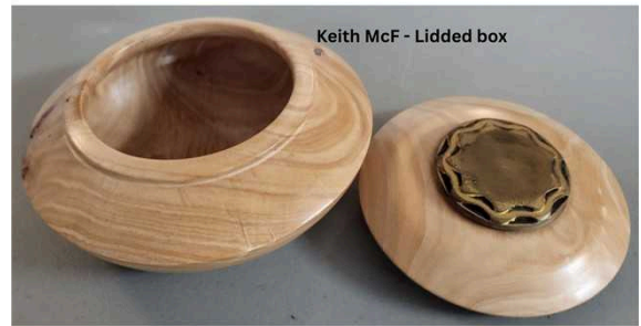
Keith McF - Lidded box