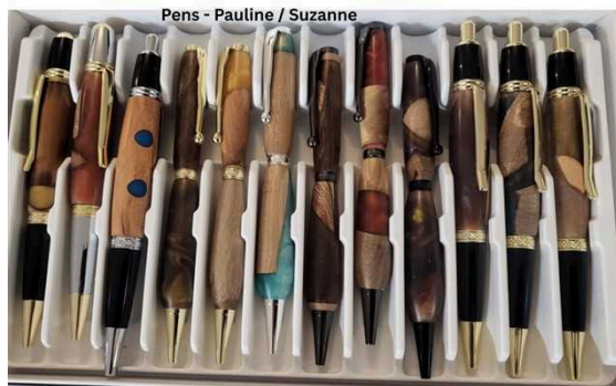
Pens - Pauline / Suzanne