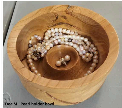
Dee M - Pearl holder bowl