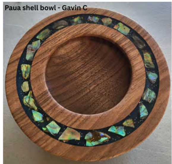
Paua shell bowl - Gavin C