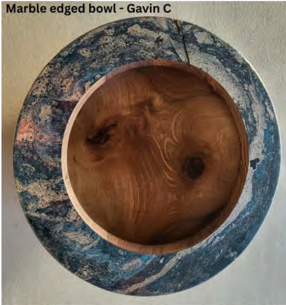
Marble edged bowl - Gavin C