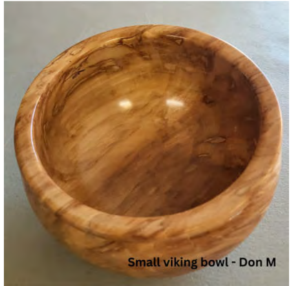
Small viking bowl - Don M