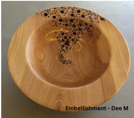
Embellishment - Dee M