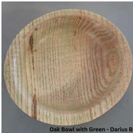
Oak Bowl with Green - Darius B