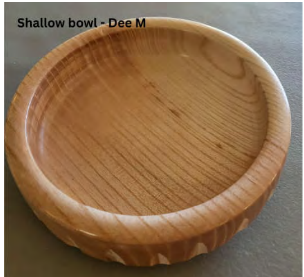
Shallow bowl - Dee M