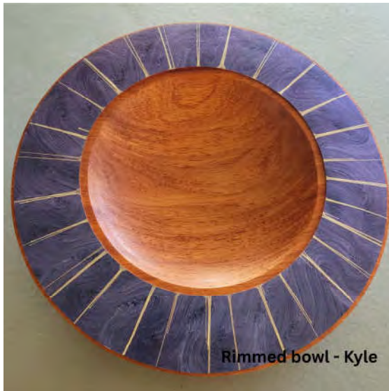
Rimmed bowl - Kyle