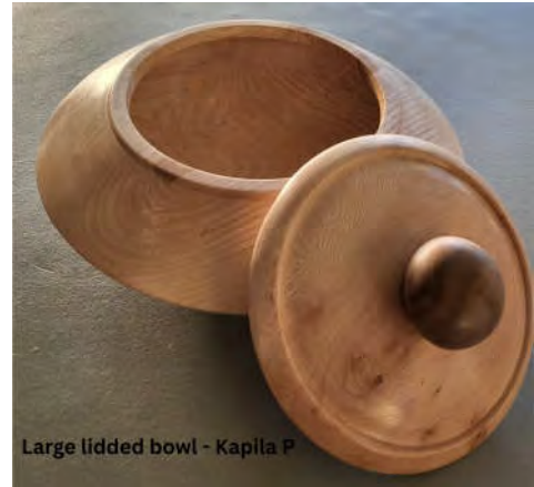
Large lidded bowl - Kapila P