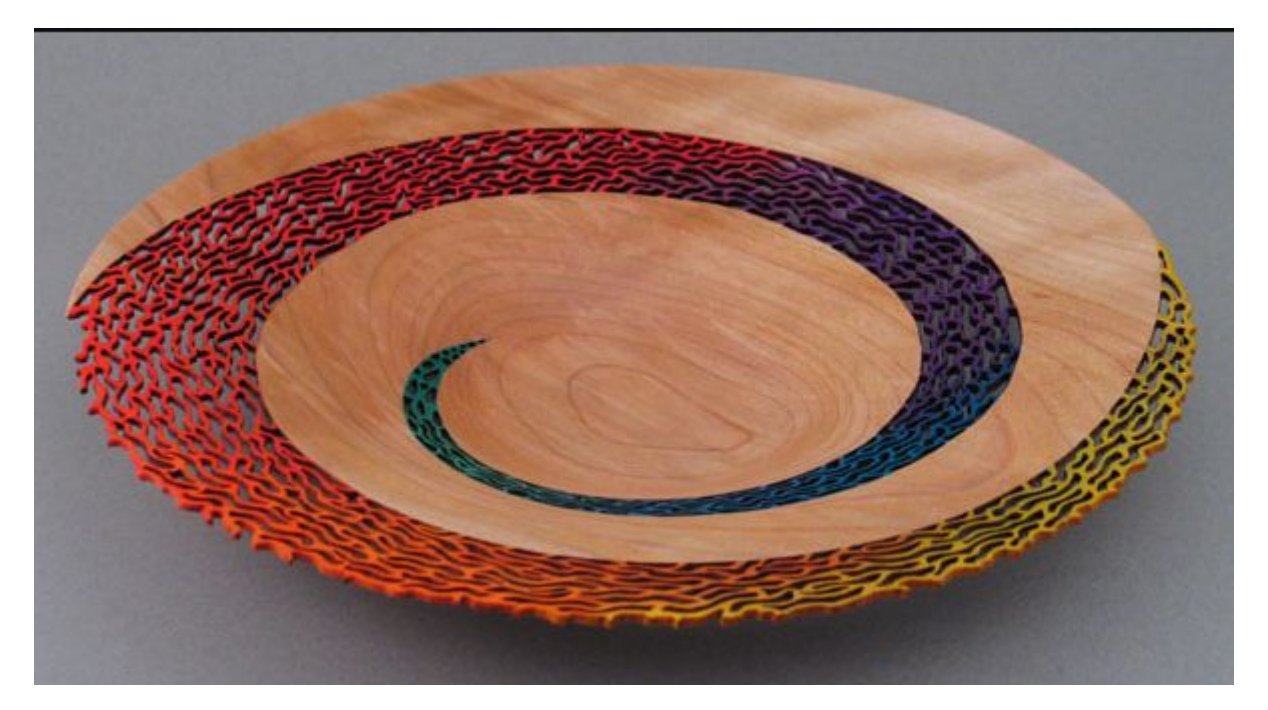
<u>https://www.woodchuckwoodturning.com/gallery/Rainbow-Vortex.jpg</u> Rainbow platter – Artist unknown