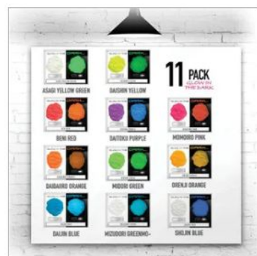
Eye Candy Glow in the Dark Box Set 11