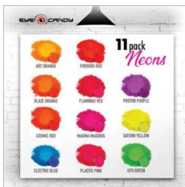
Eye Candy Neon Series Box Set 11

The judges will be specifically looking for how colour or other embellishment has been used to enhance the work.