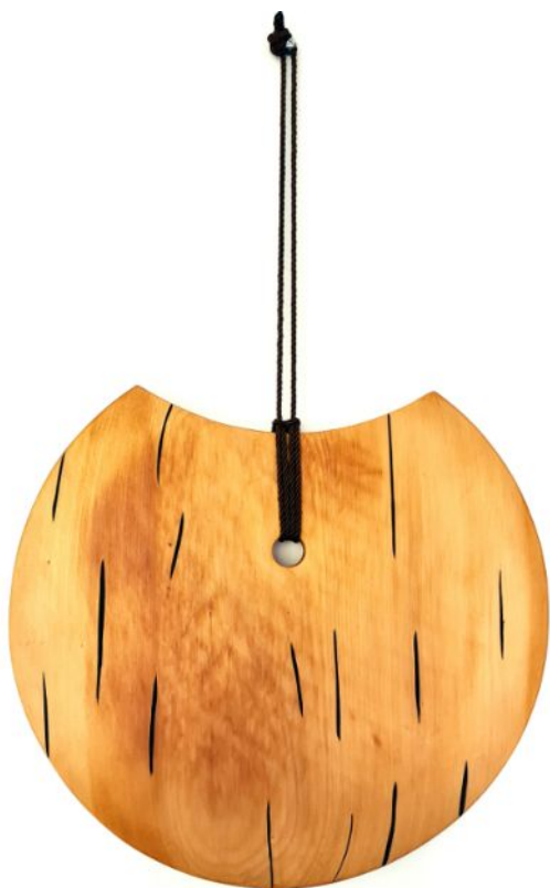
Shannon Turuwhenua: Marama