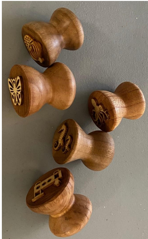
2 nd Nette Edlin Playdo stamps