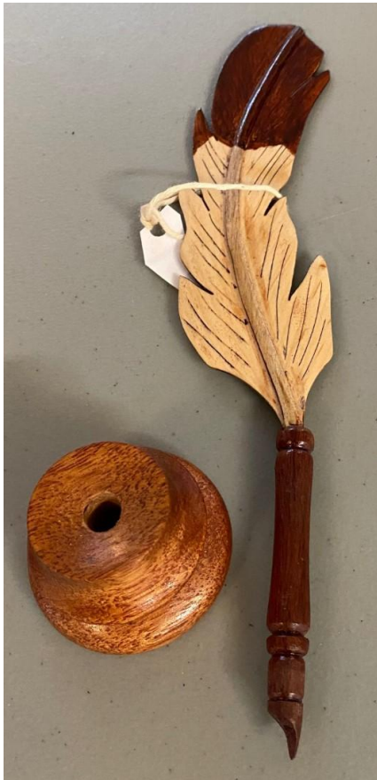
1 st Gavin Chalk Feather pen