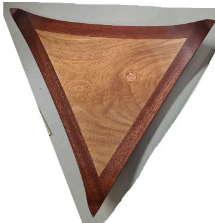
2 nd – Gavin Chalk Tri platter