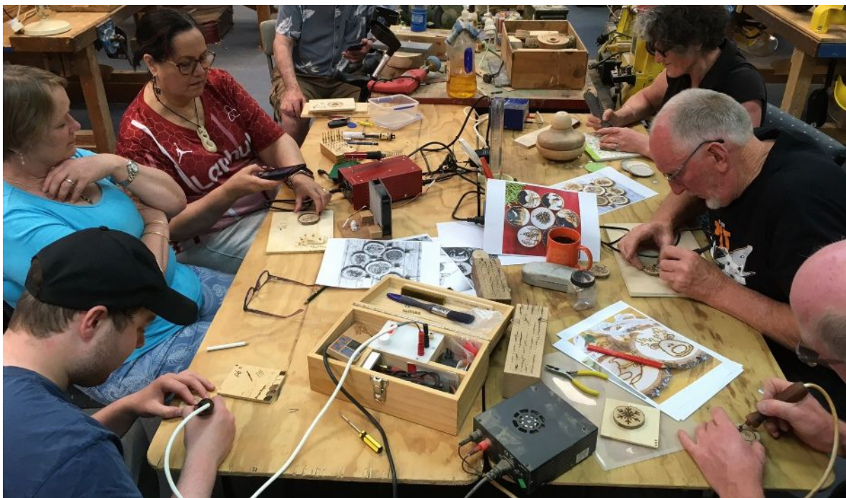
The Team Hard At Work