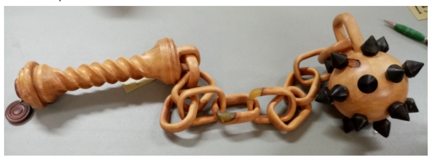
2<sup>nd</sup> – Gavin Chalk