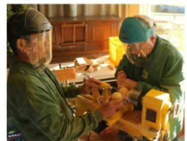
Timaru Funday "Bat and Ball" Competition