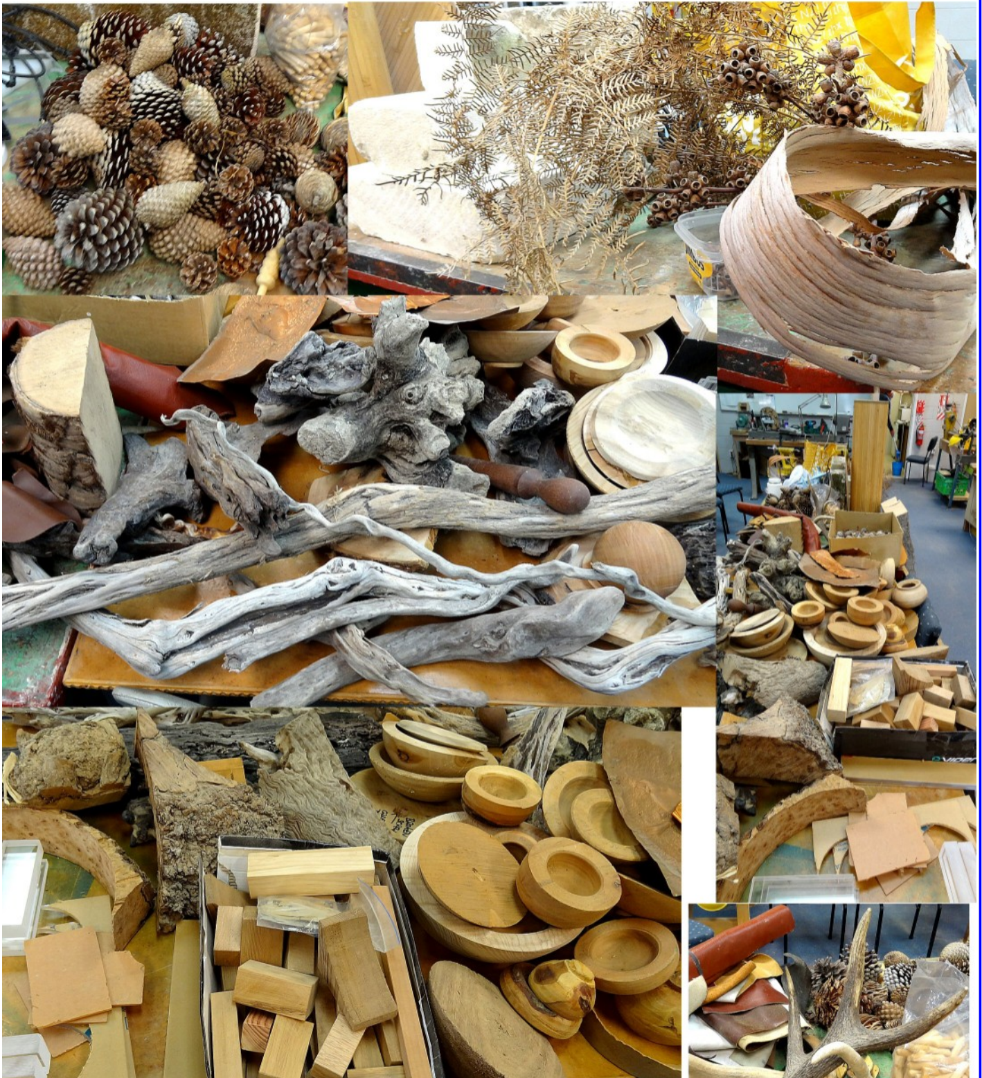
Raw Materials for the Participation Weekend with a Recycling theme

Photos from the weekend on Pages 3 to 8.