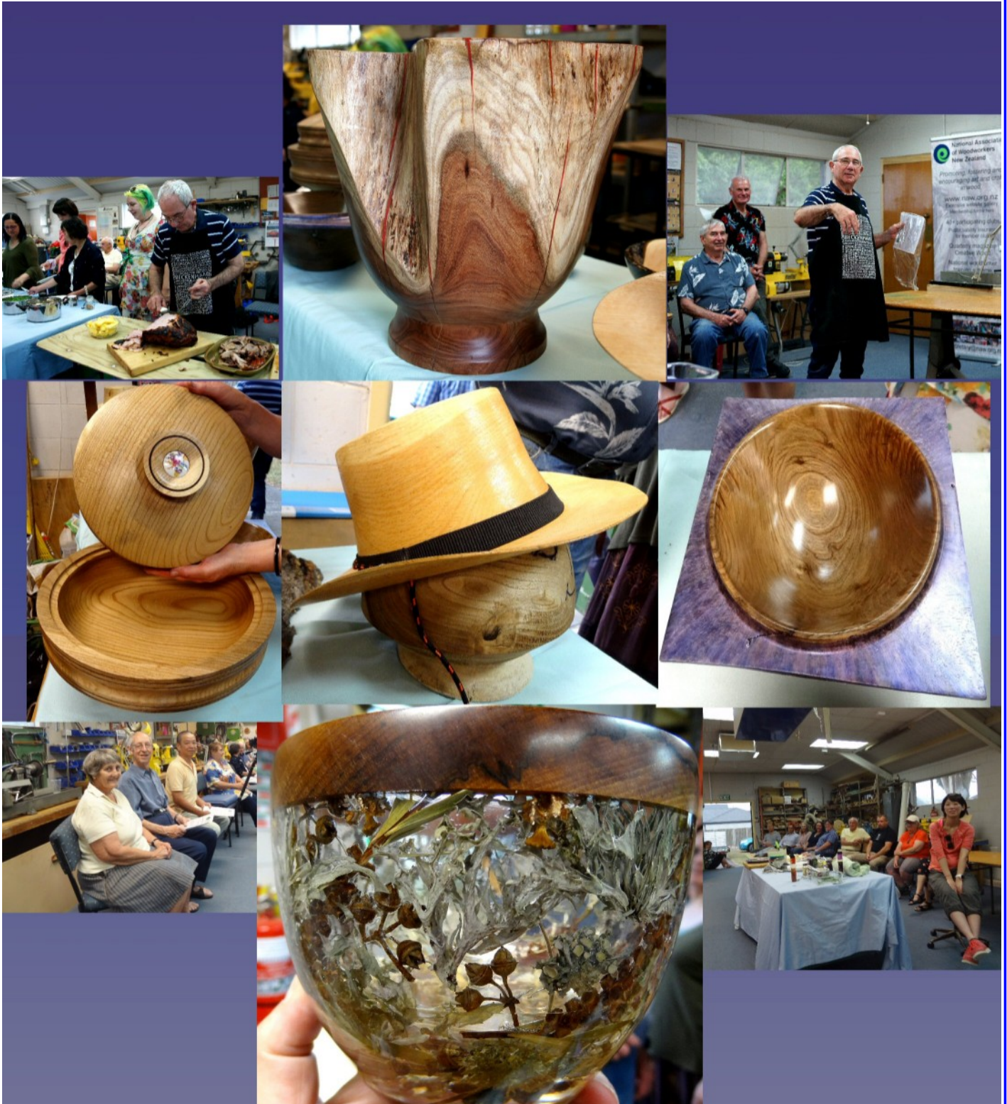
Class 14 Graduation