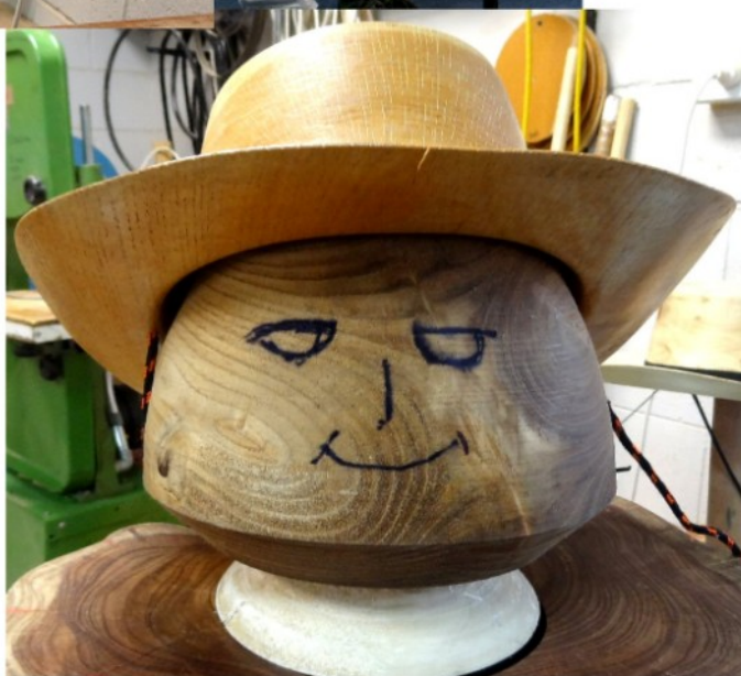
Class 14 Graduation Lim Boom Tan