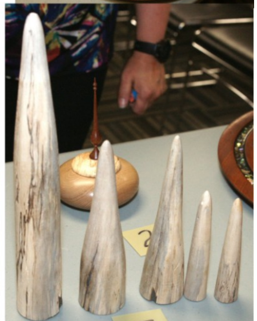
October Show Table