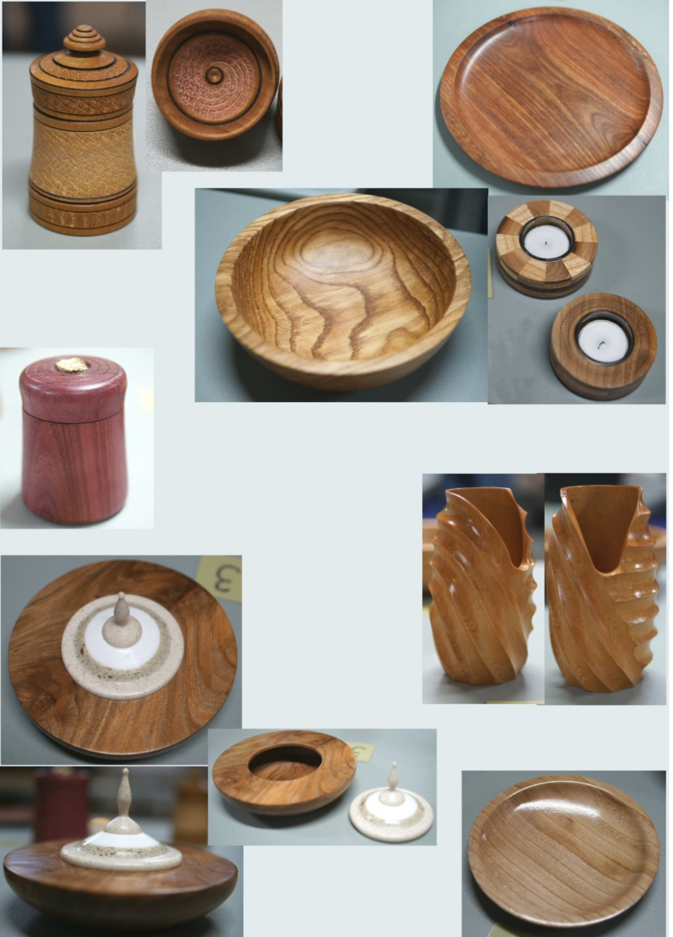
September Competition Table