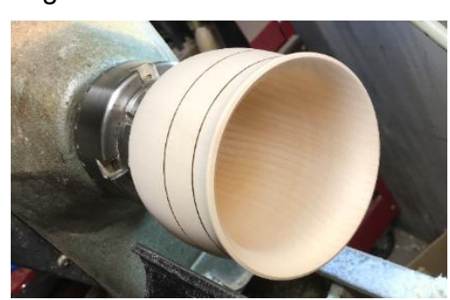
Create the embellishment area using burnishing wire Hollowed out to a uniform thickness