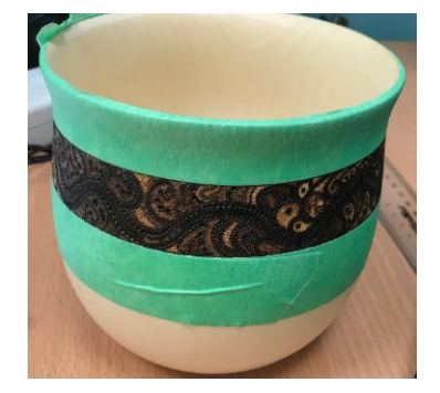
Masking off the embellishment area