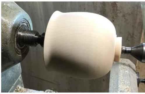
Rough out form and cut tenon for chuck mounting