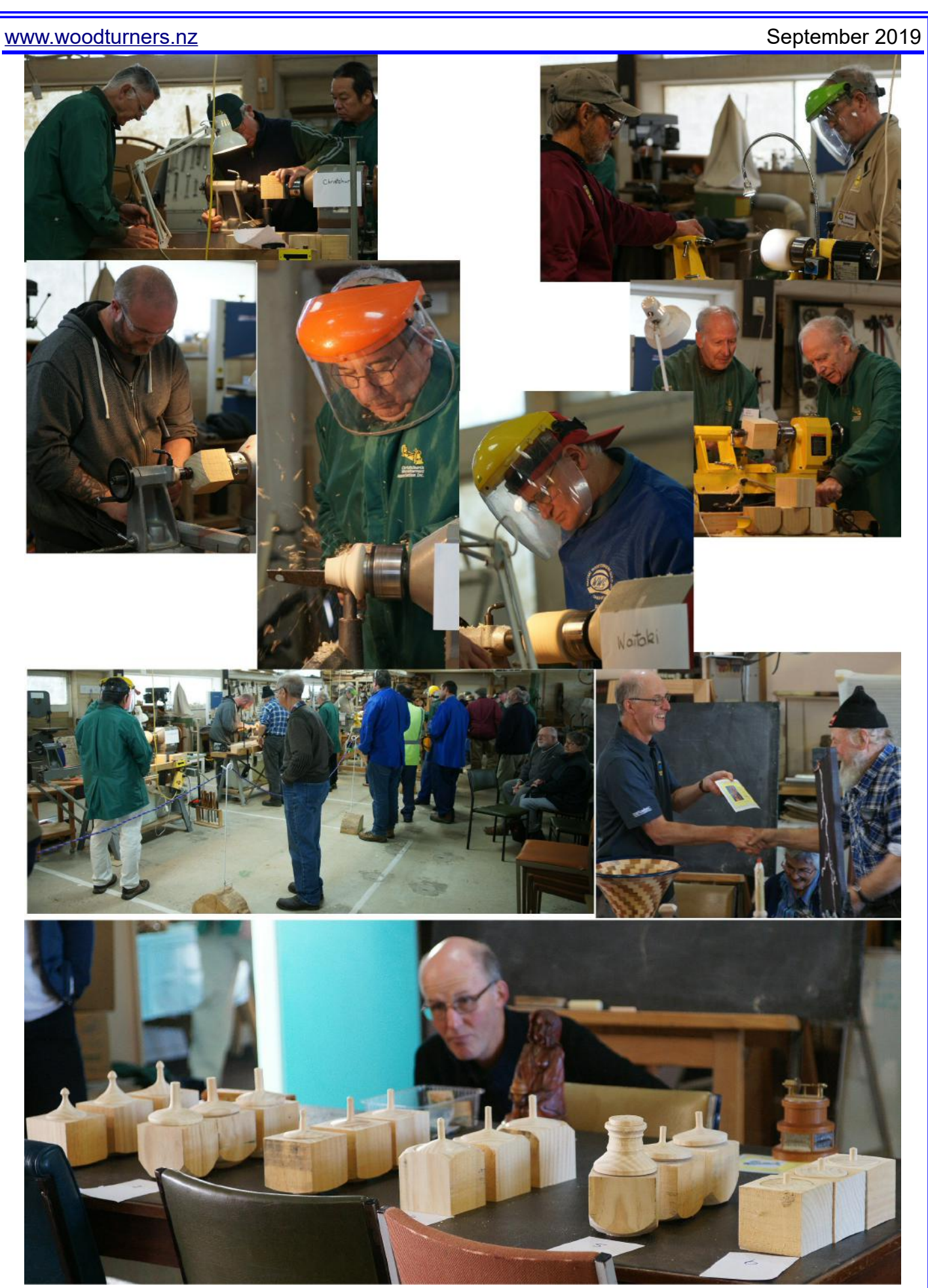
South Island ~ Funday. Three Square Boxes with Spinning Top Lids Looking for the three that look most similar. Won by Waitaki