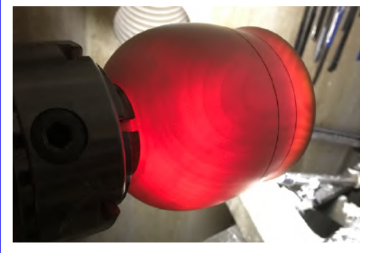
Using a light to gauge uniform thickness