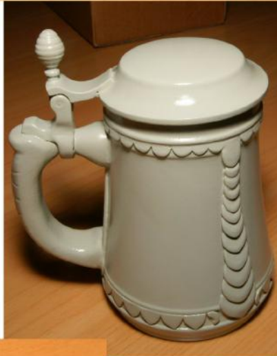
2nd Robin Blowers