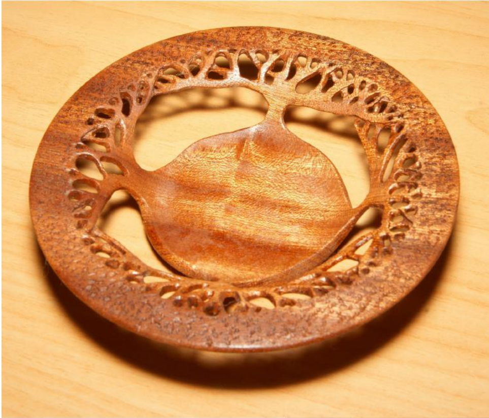
1st Campbell Botting