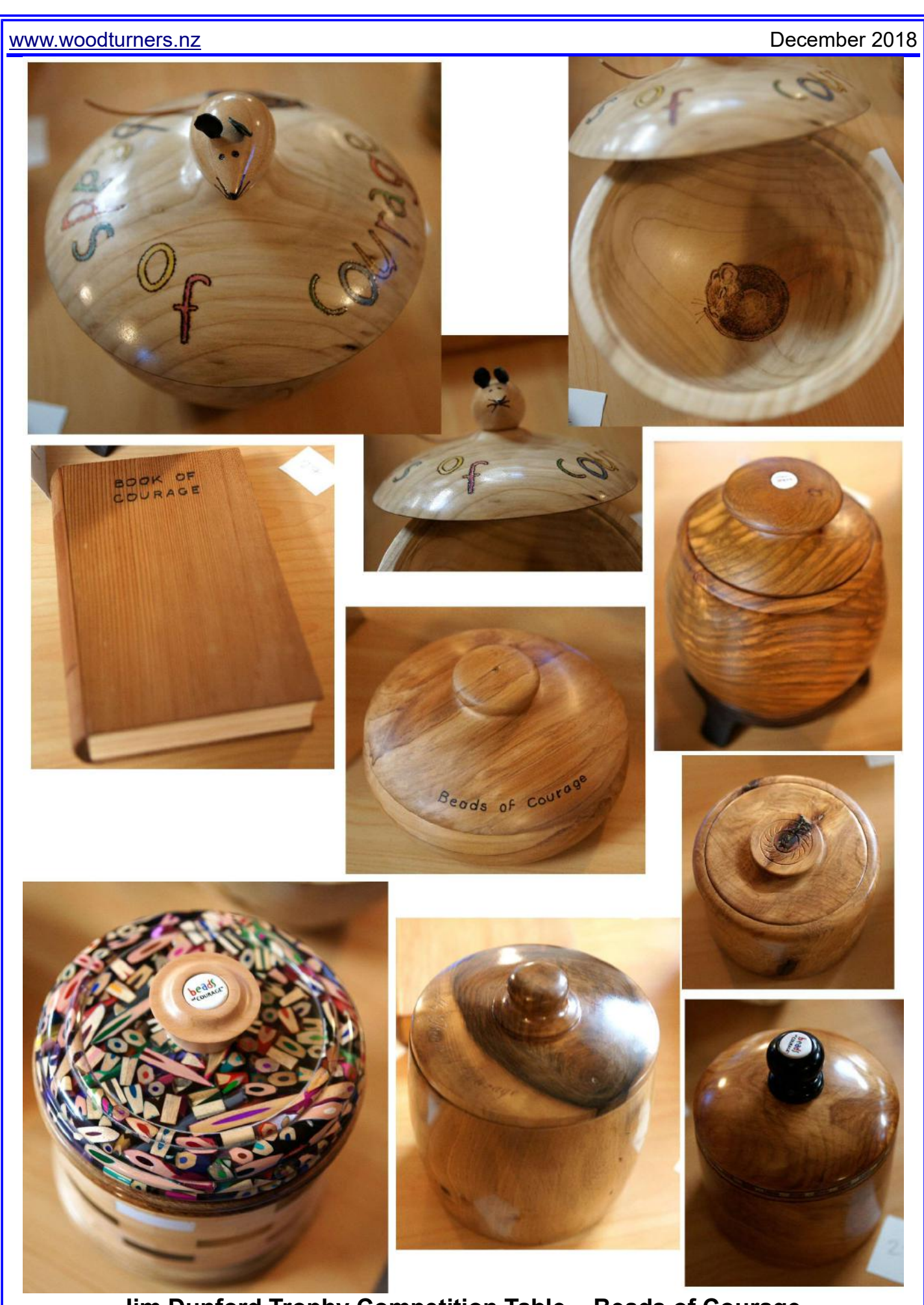
Jim Dunford Trophy Competition Table ~ Beads of Courage