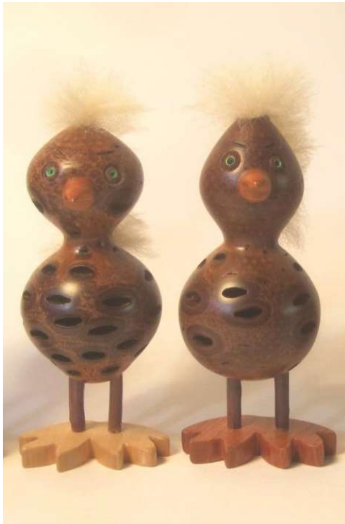
Tokoeka ( Apteryx australis ) Southern Brown Kiwi. So cute! Make to your own design.