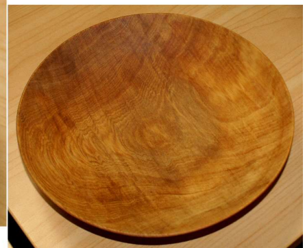
July Competition Table ~ All other entries were 3rd=