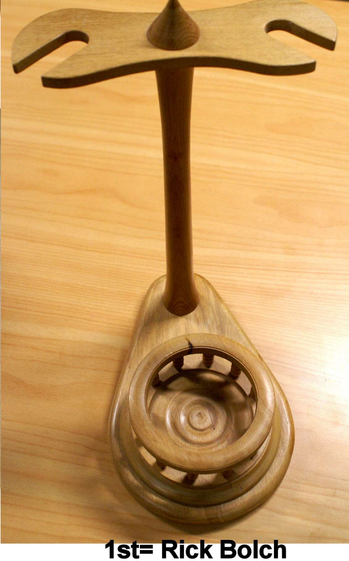
March Competition Table