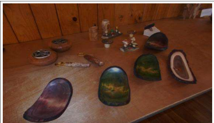
The "workroom" at Wajora