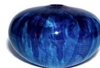
Chris Pytlík, Utah, USA