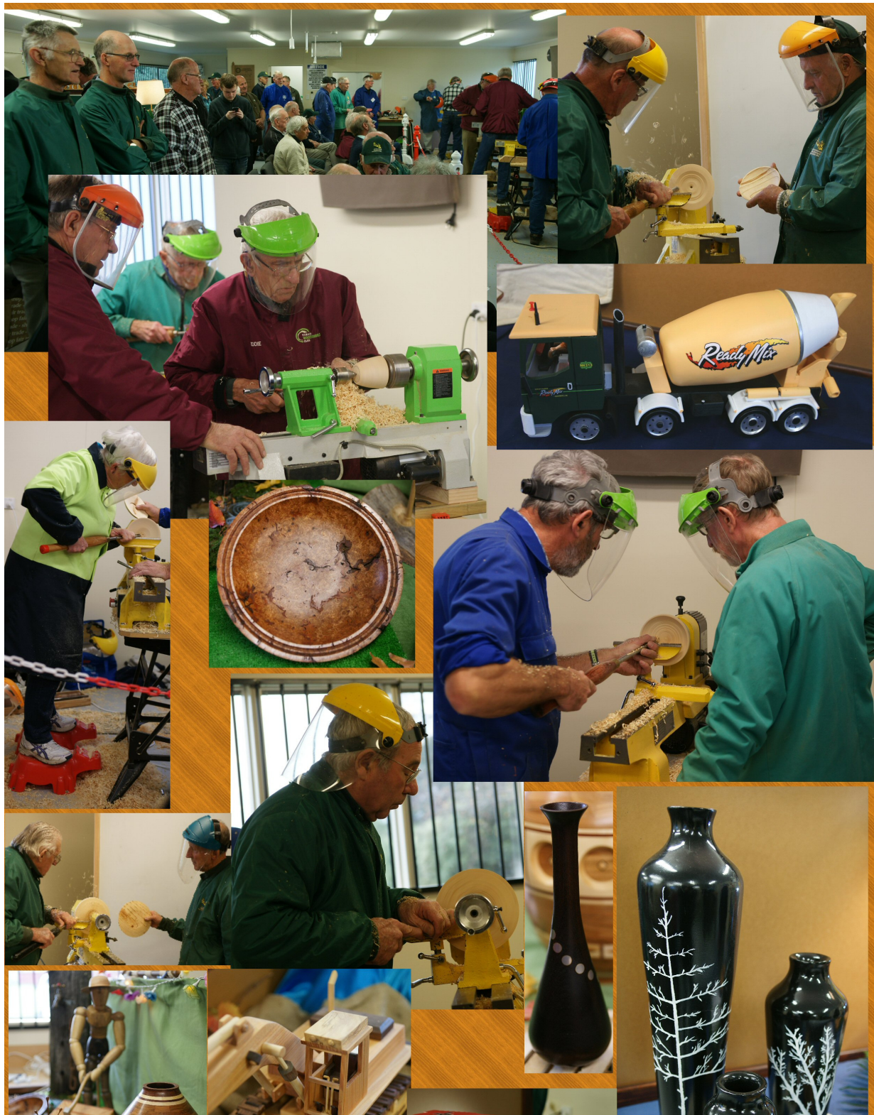
South Island Fun Day at Ashburton Saturday 21 st May