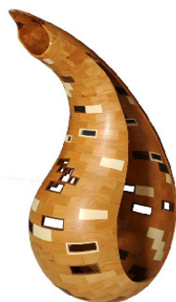
Curt Theobald Wyoming, USA www.curttheobald.com