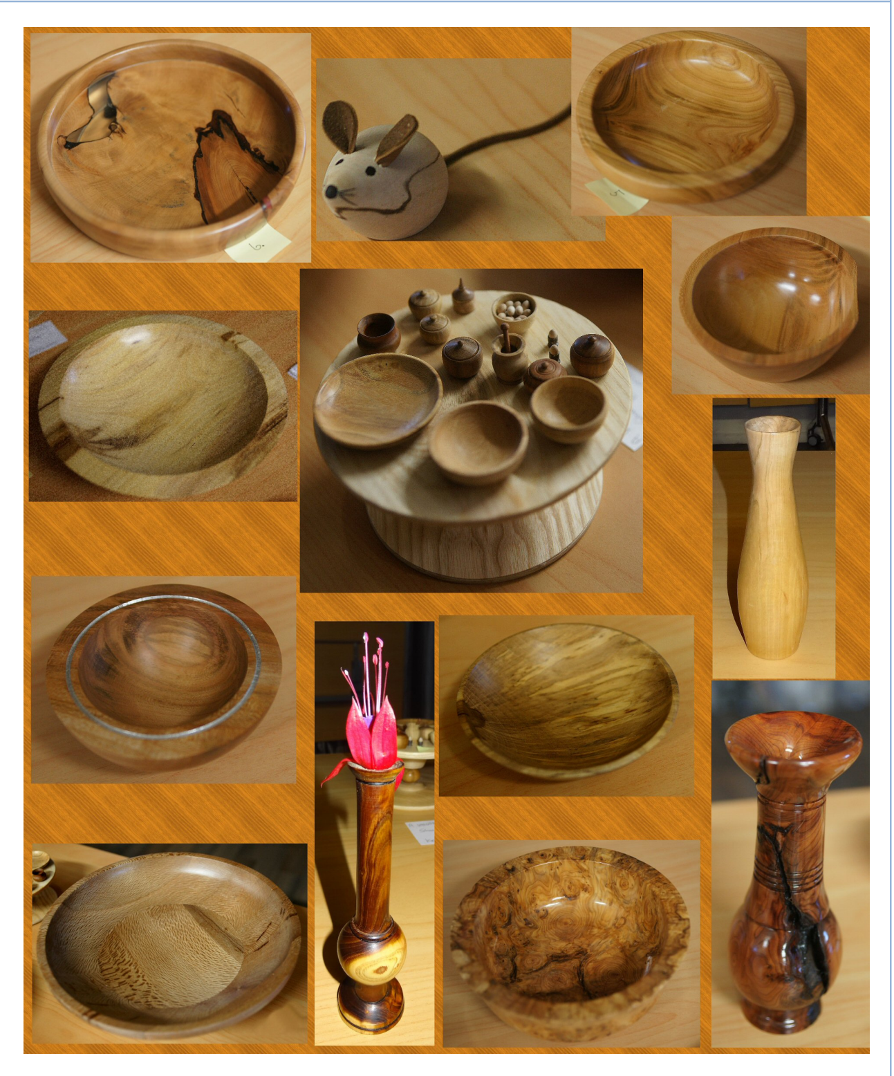
March Competition Table