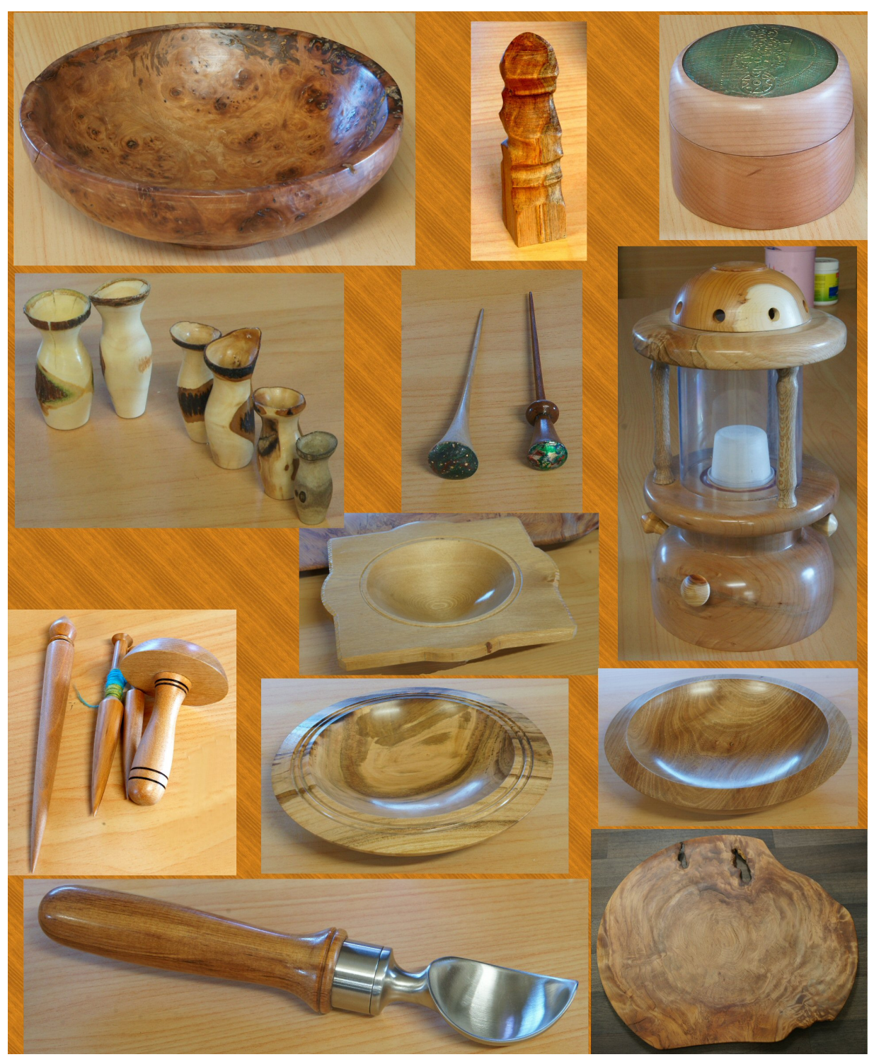
February Competition Table