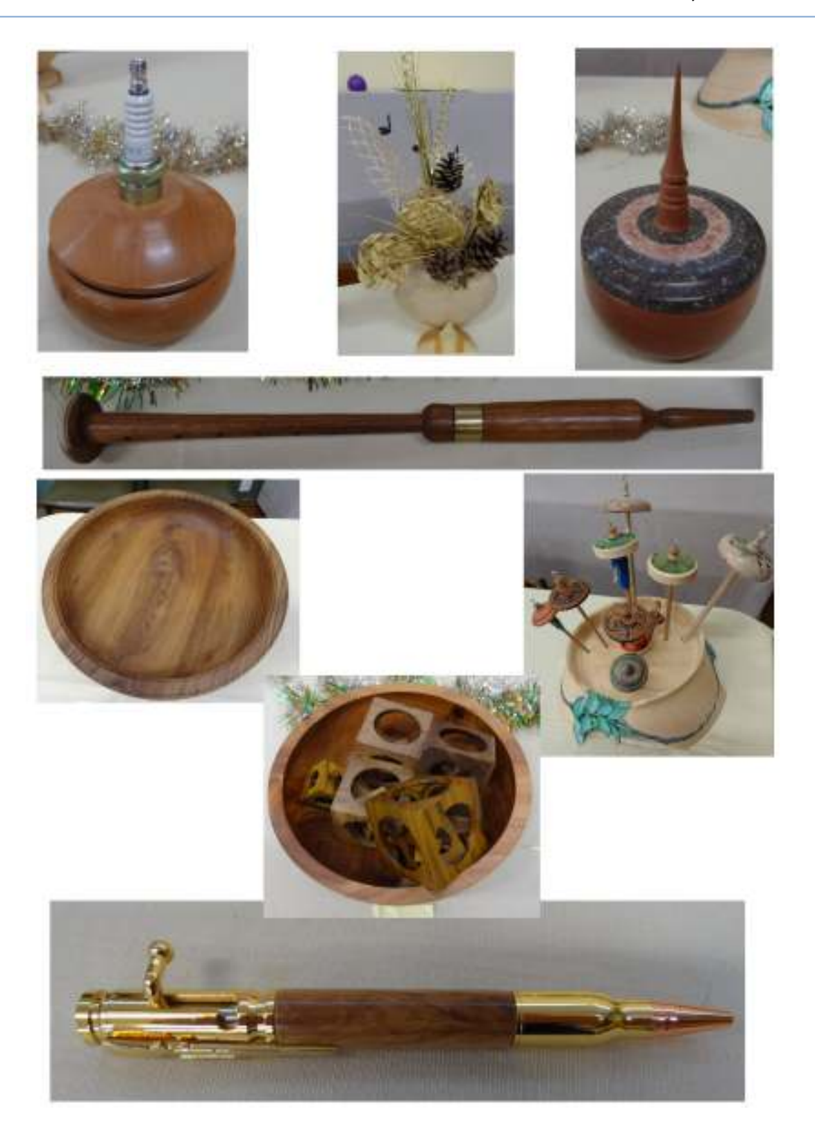
December Competition Table