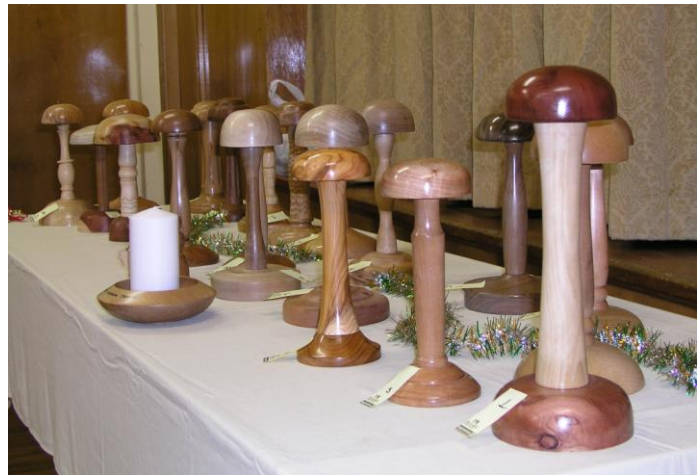
The wig stands ready for judging