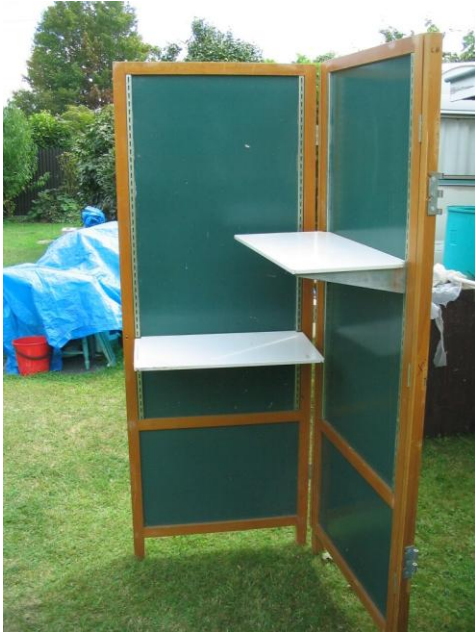
Stands free to a good home

Shown in the photo below are two of five free-standing display units. There are 23 shelves and brackets. Contact Bruce Irvine if you are interested in them.