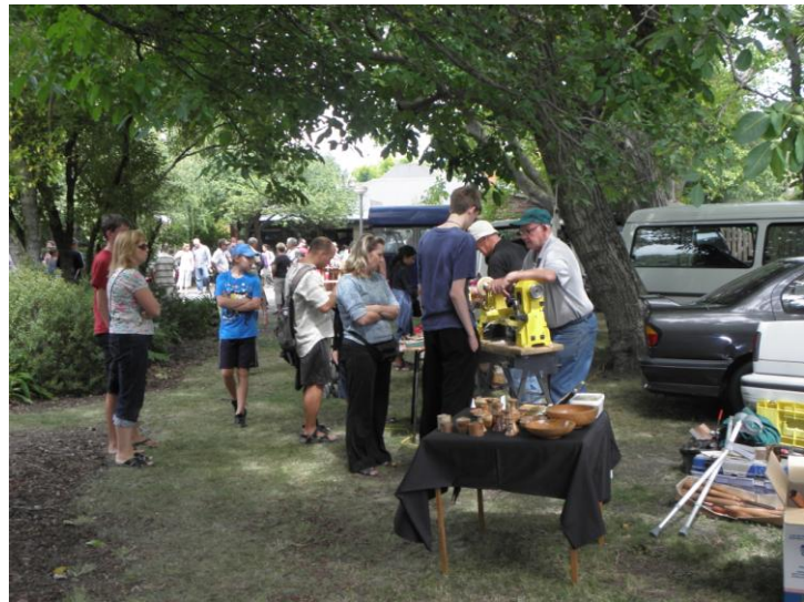
Under the greenwood trees. At the Avice Hill Craft Fair.