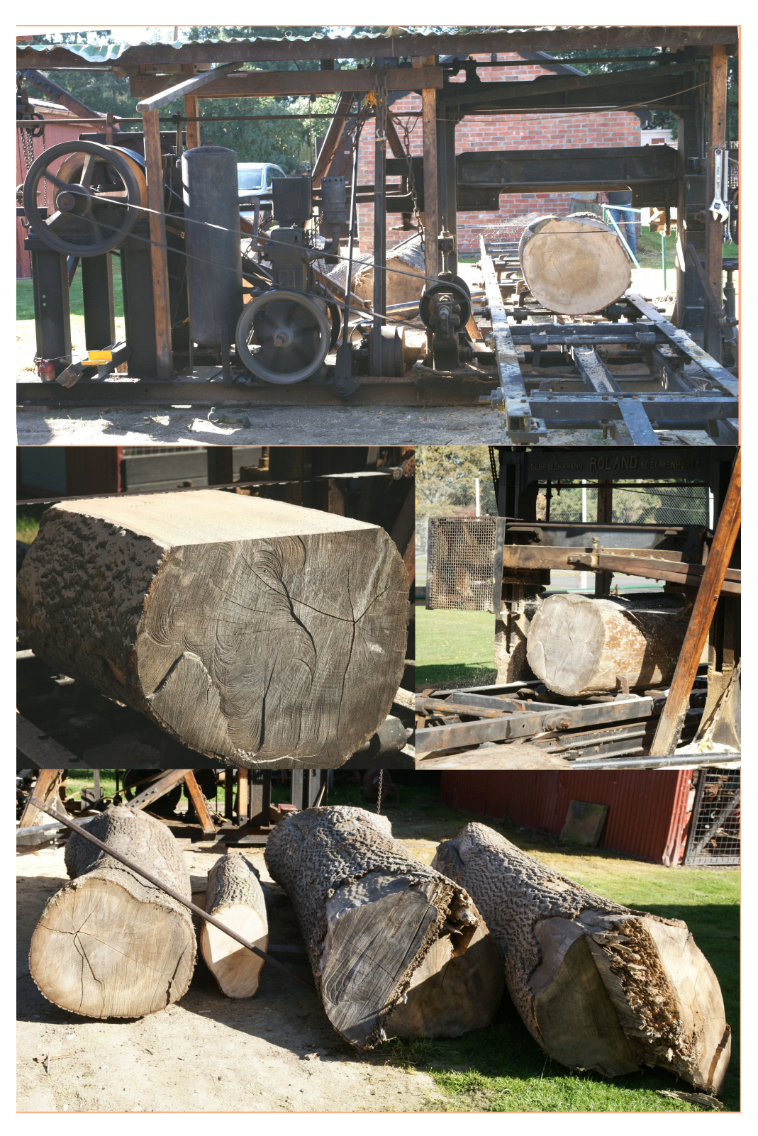
Saw Mill operating at the South Island Funday in Ashburton