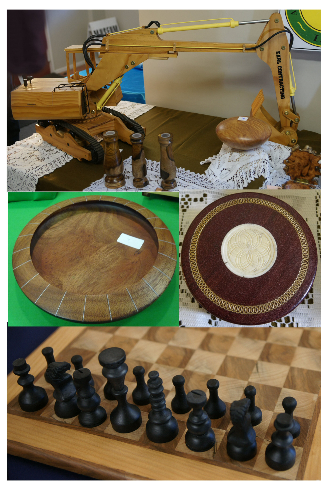
South Island ~ Funday