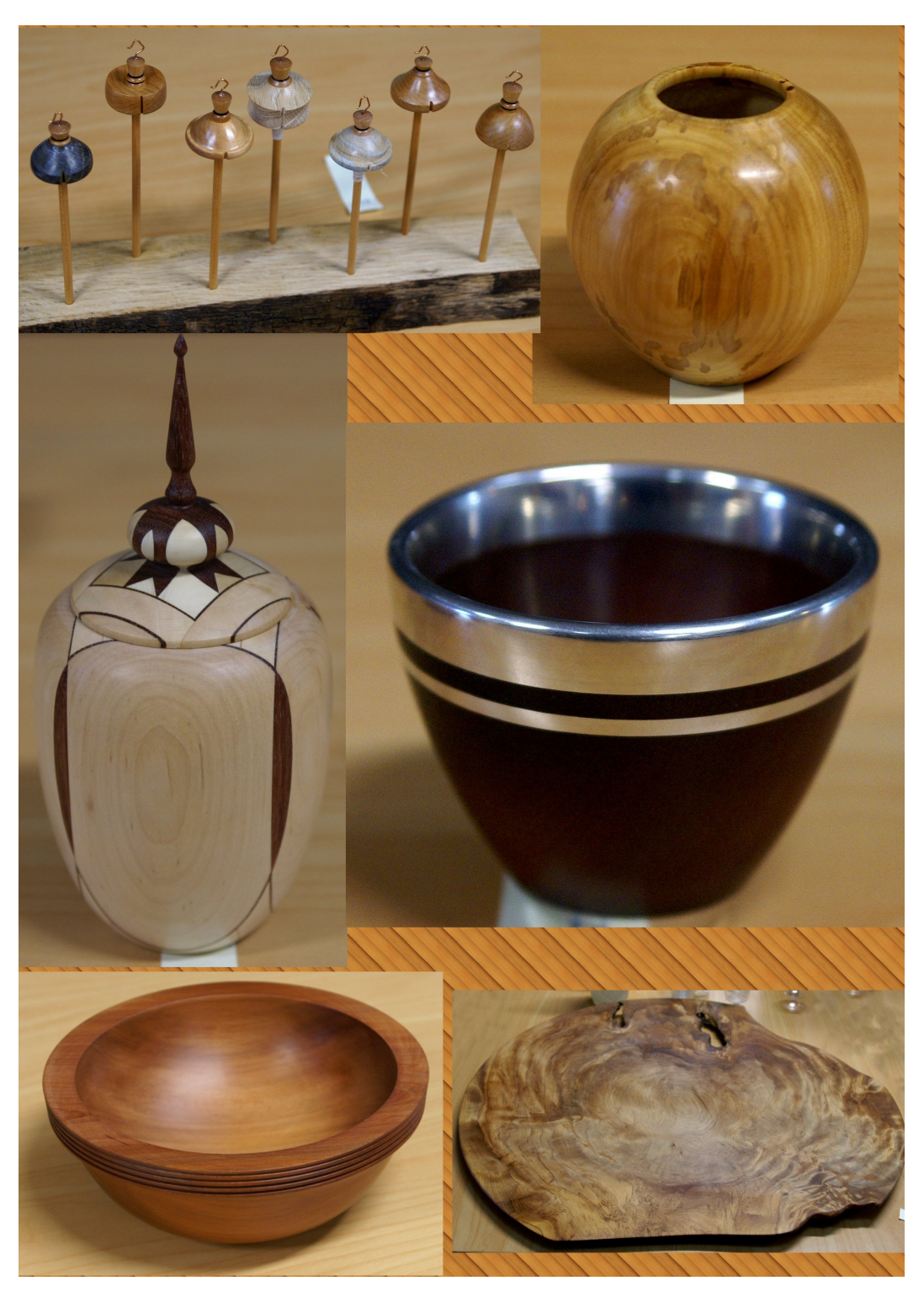
Competition Table December 2016