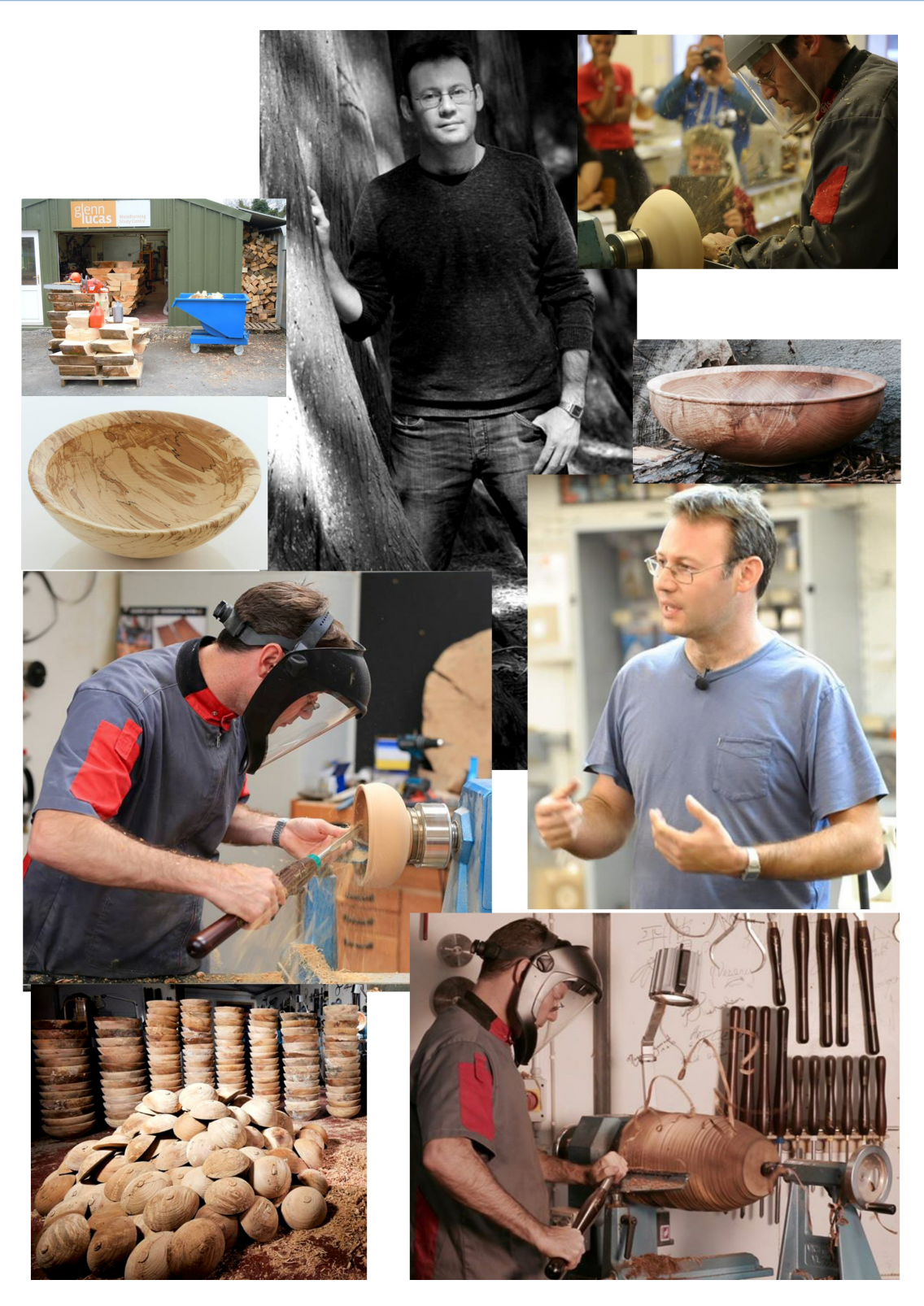
Glenn Lucas Photo Montage