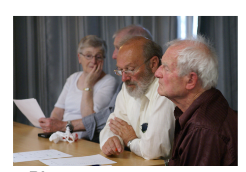
More Christmas Party Photos