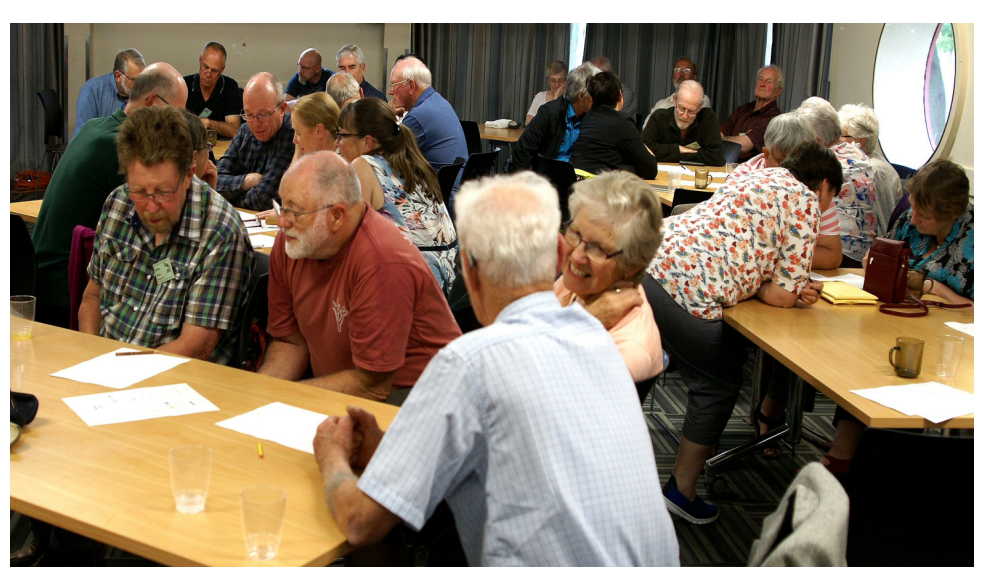
Christmas Party 2016