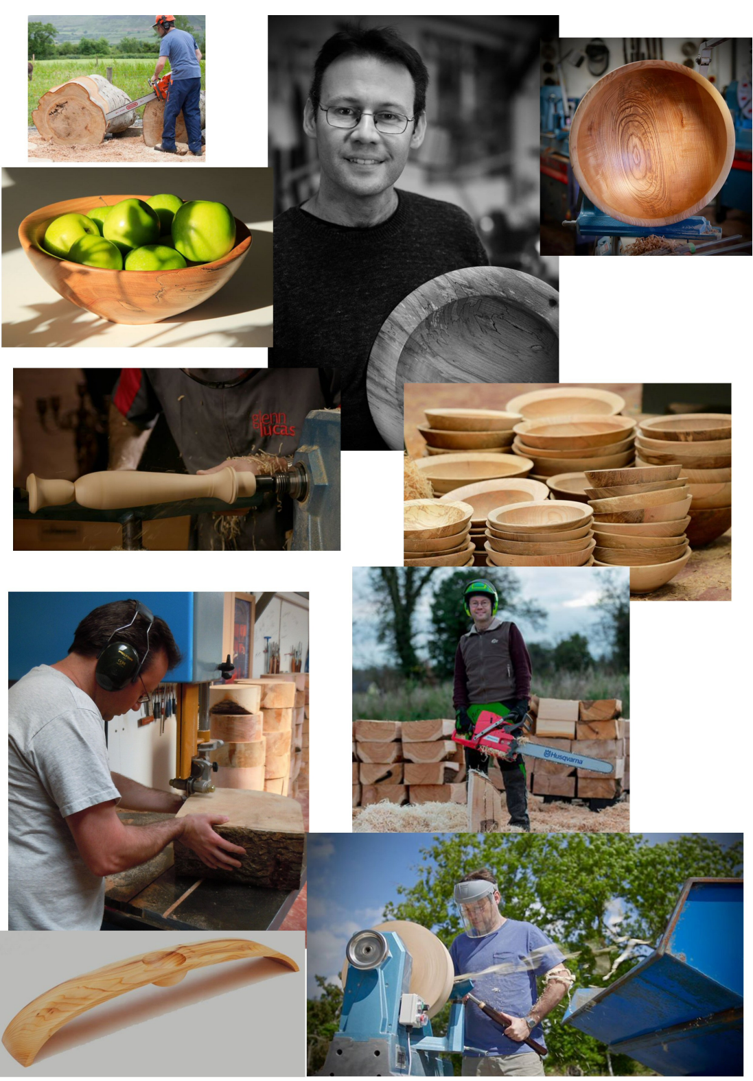
Glenn Lucas Photo Montage