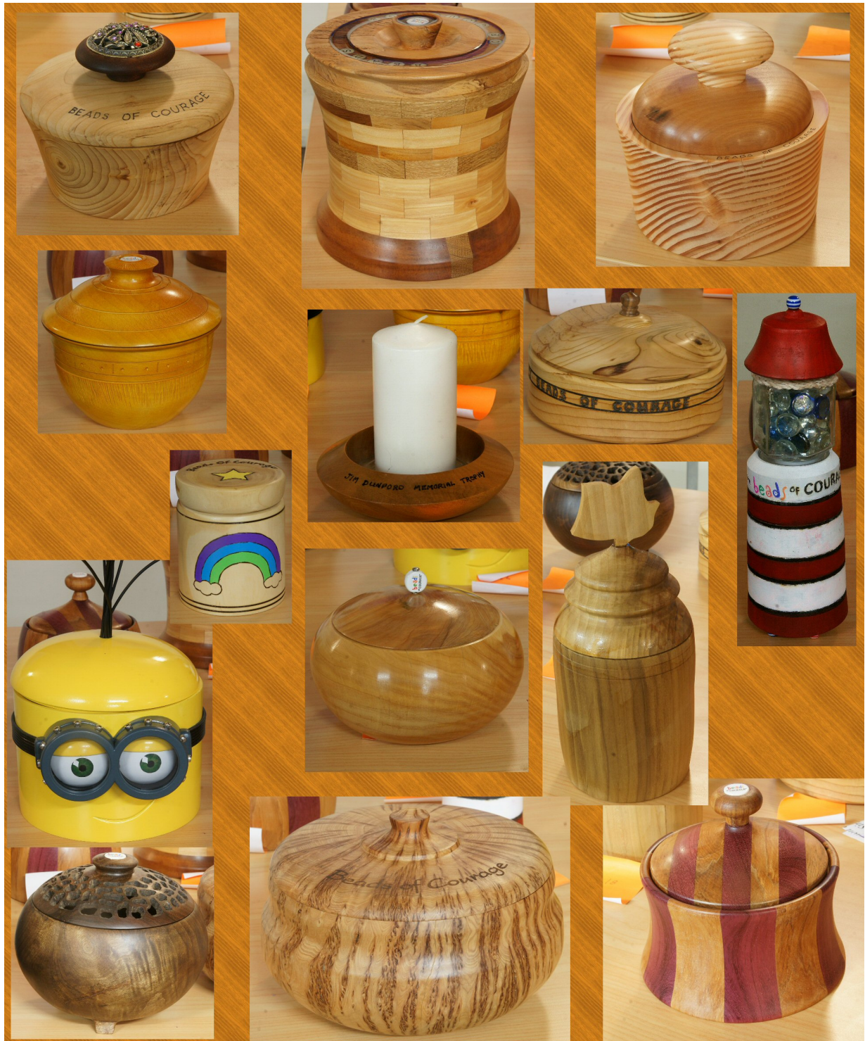
Beads of Courage