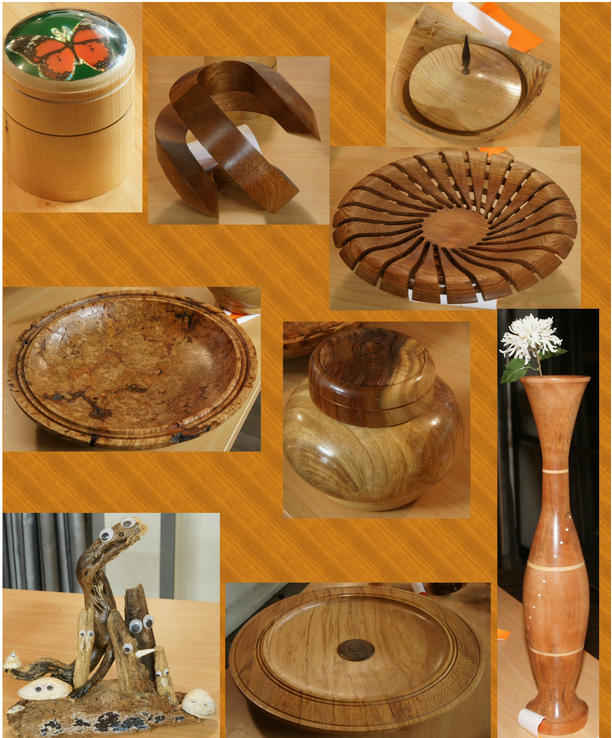
December Competition Table