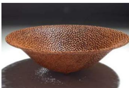
Coral Embellishment on an Ogee Form