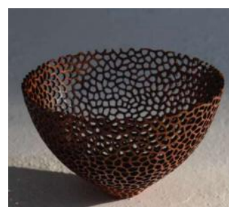
Pieced Thin Walled Bowl