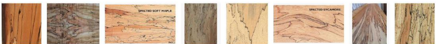
some examples of spalting

We have received a paper from Graham Trost about the dangers of the cryptococcosis infection. The infection, cryptococcosis, affects the lungs first, because it is acquired by inhaling fungal spores. There were only 96 cases in Australia between 2000 and 2007 and 13 per cent died within four months. It is a good opportunity to remind everyone that although spalting looks great, it is caused by a living fungus and the fungus will release spores when turned or sanded. So when working with any spalting timber we must wear breathing protection.