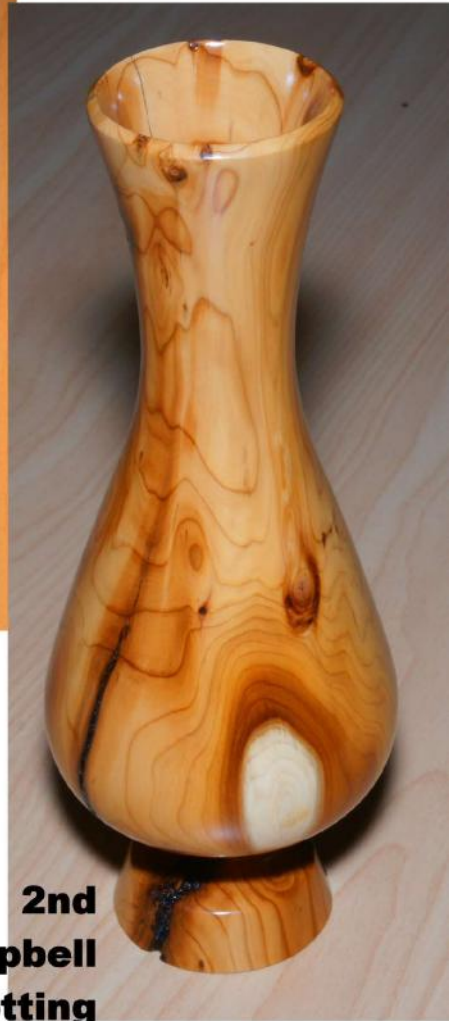
2nd Campbell Botting