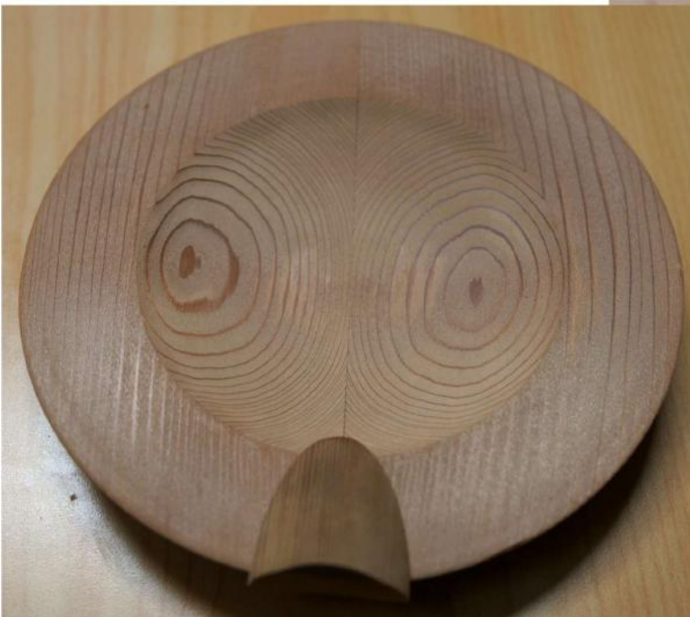
November Competition Table