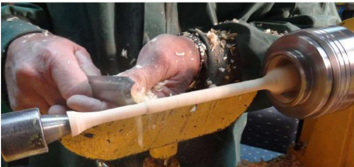
Turning Wooden Axles