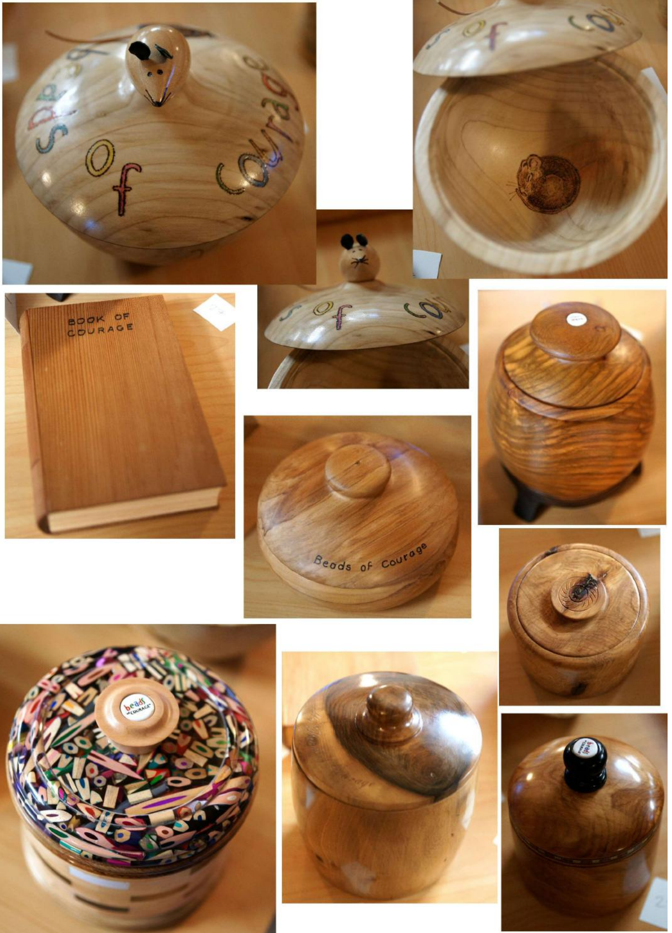
Jim Dunford Trophy Competition Table ~ Beads of Courage