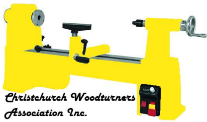
Christchurch Woodturners Association Inc.