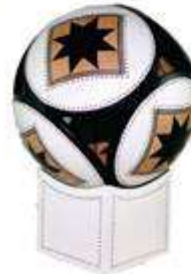
Eli Avisera, Israel turninggallery.org /eli-avisera.html