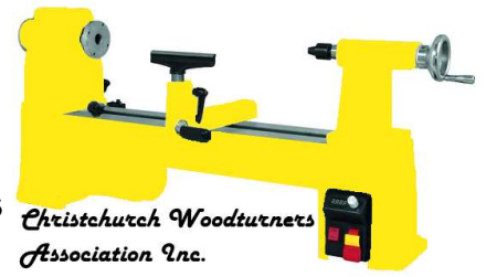
Christchurch Woodturners Association Inc.