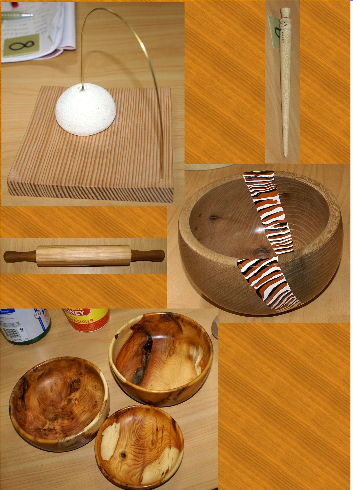
June Competition Table