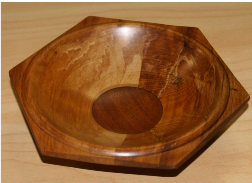
2nd= Alan Prentice