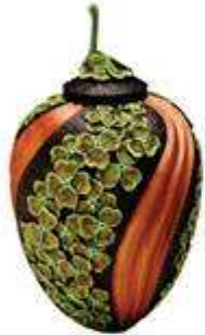
Dixie Biggs, Florida, USA dixiebiggs.com