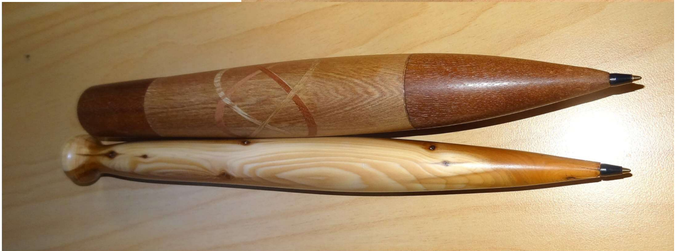
May Competition Table