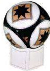
Eli Avisera, Israel turninggallery.org /eli-avisera.html