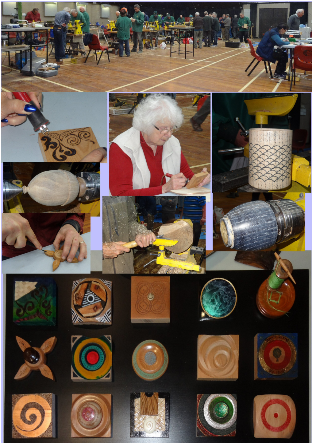
20 th Anniversary Workshop on Saturday 3 rd Sept at The Cashmere Club