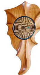
Guilio Marcolongo Wonthaggi, VIC

29 September to 2 October 2016 at Kings College, Otahuhu, Auckland