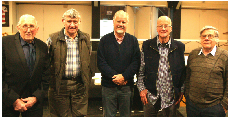
Original Members at the Anniversary Dinner