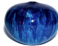
Chris Pytlik, Utah, USA