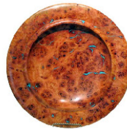
Hugh Mill, Lower Hutt