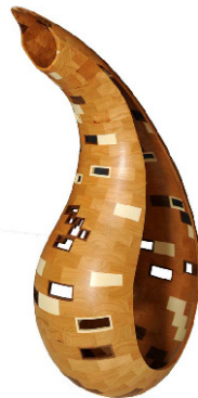
Curt Theobald Wyoming, USA www.curtheobald.com