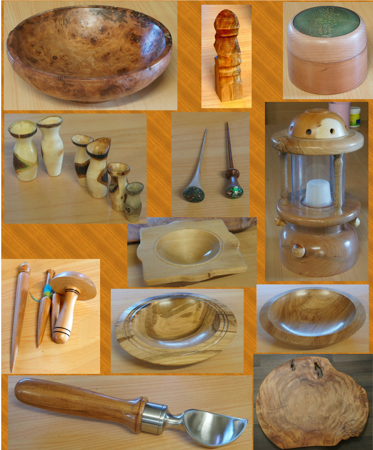
February Competition Table