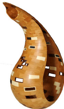
Curt Theobald Wyoming, USA www.curttheobald.com