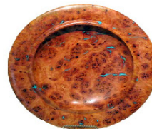
Hugh Mill, Lower Hutt