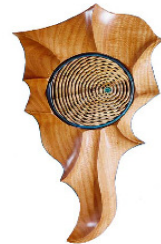
Guilio Marcolongo Wonthaggi, VIC

29 September to 2 October 2016 at Kings College, Otahuhu, Auckland