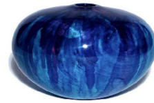
Chris Pytlik, Utah, USA