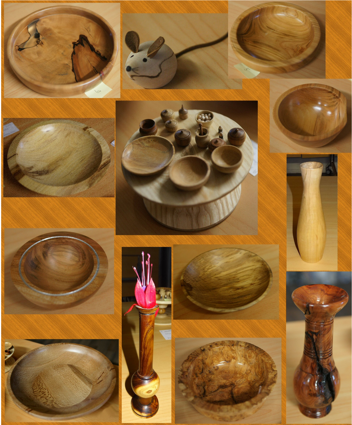
March Competition Table