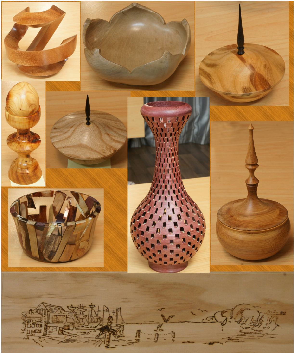
November Competition Table