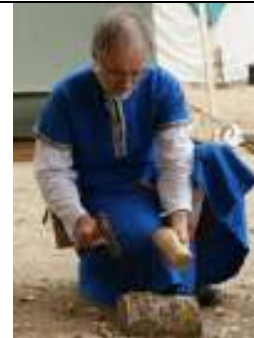
More Roughing out (with axe)