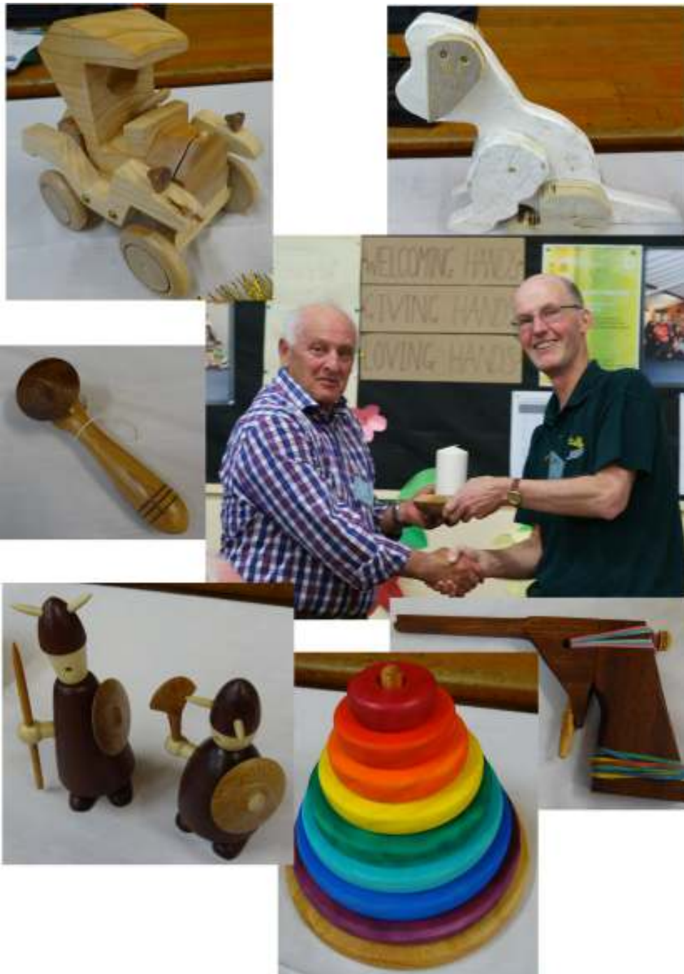
Jim Dunford Trophy (This year for Childrens Toys)