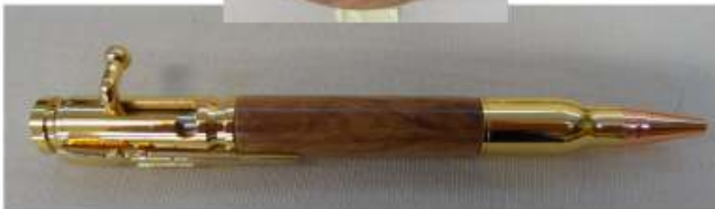
December Competition Table