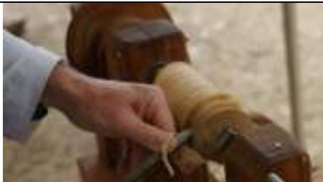
Back on the lathe (spindle gouge)