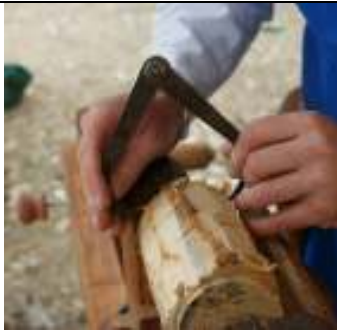
Measuring both ends to same Diameter