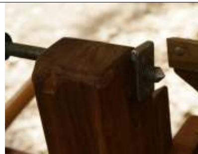
Tail Stock (bees wax used as lubricant)