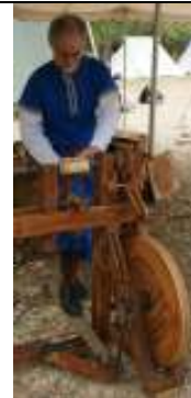
Treadling (using parting tool)