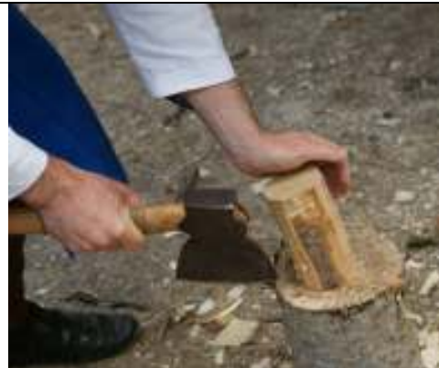
Roughing a blank