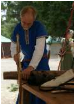
Cutting a blank

history, with a particular focus on its practical applications in arts and sciences, including costuming, cooking, martial arts, dance, calligraphy and illumination, metalwork, archery, music and much, much more. And who did I find there – Lord Lowrens Wilyamson – a 14 th Century woodturner from the Scottish lowlands.