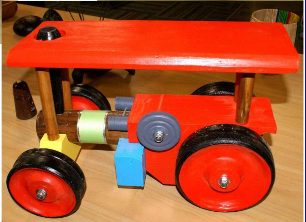
Peter Hutchinson Trophy ~ Other Entries