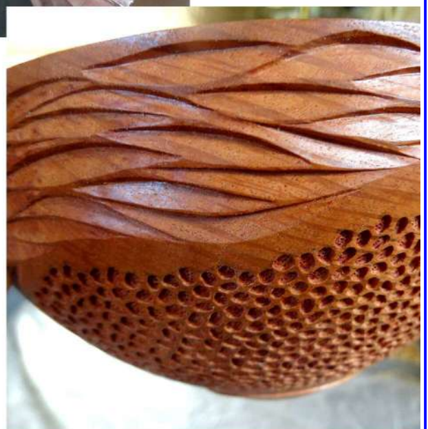
Neil Turner at Spin Around Waitaki