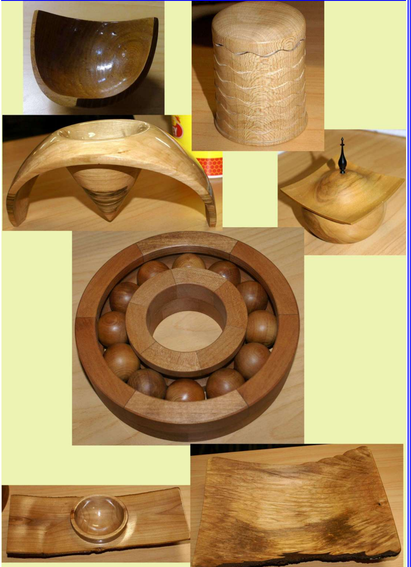
October Competition Table