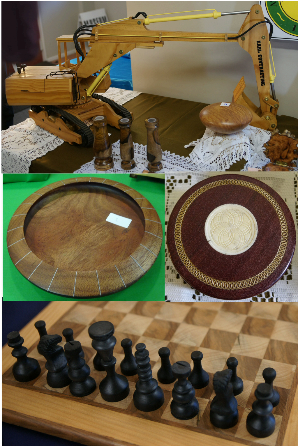
South Island ~ Funday