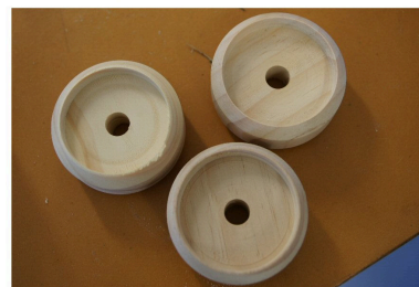
South Island Funday ~ Rolling Pin and Pastery Cutter 1 st Prize Ashburton