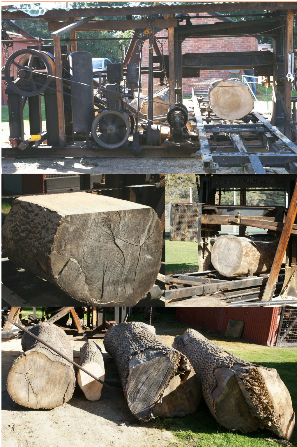
Saw Mill operating at the South Island Funday in Ashburton