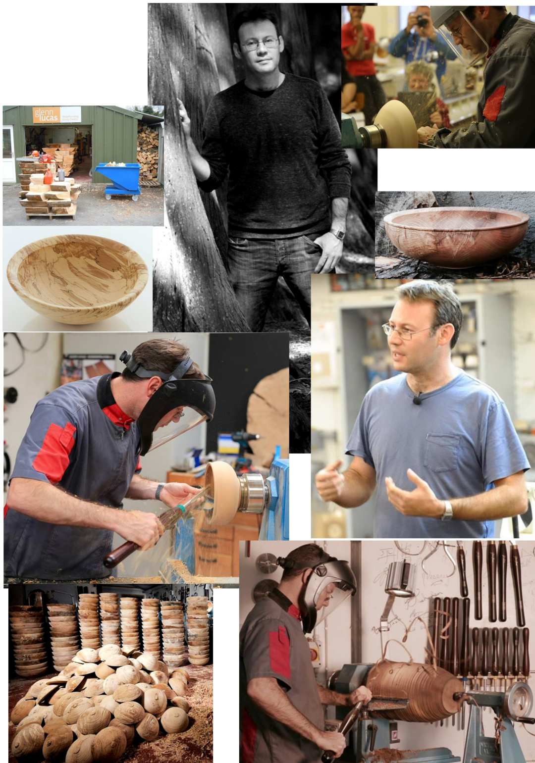
Glenn Lucas Photo Montage