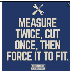
How I spend my time in my work shop