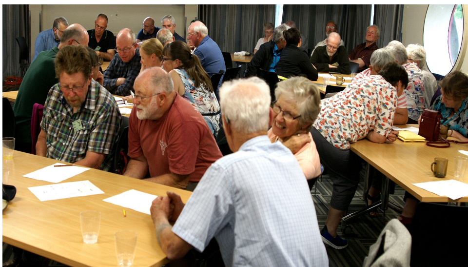
Christmas Party 2016