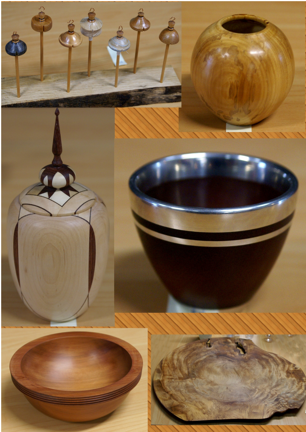
Competition Table December 2016