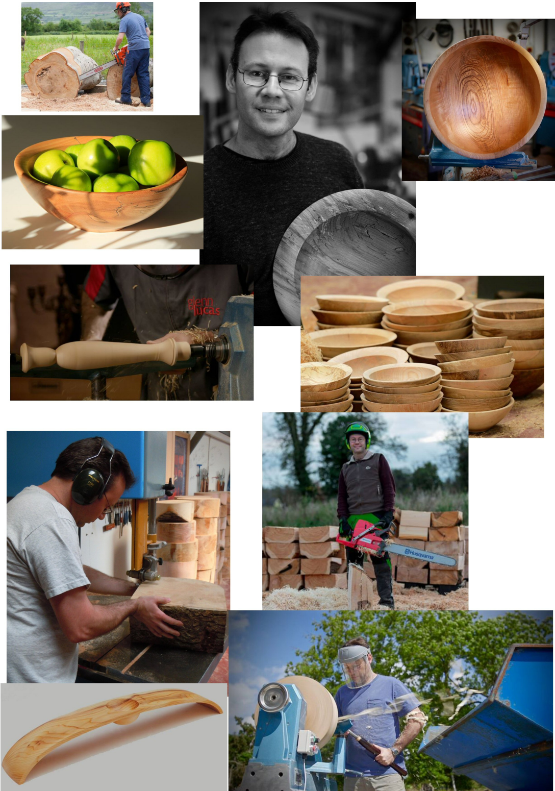
Glenn Lucas Photo Montage